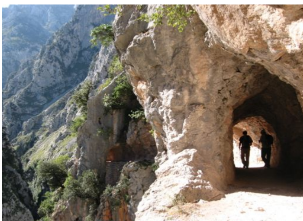
Hiking the tunnels of the Cares Gorge.