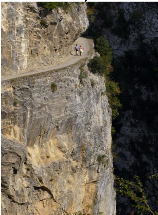
Hiking the narrowest part of the Cares gorge.