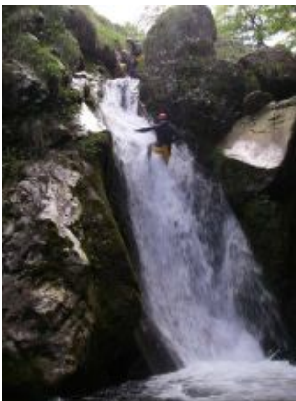
Great fun: canyoning down the Rubo River (April).