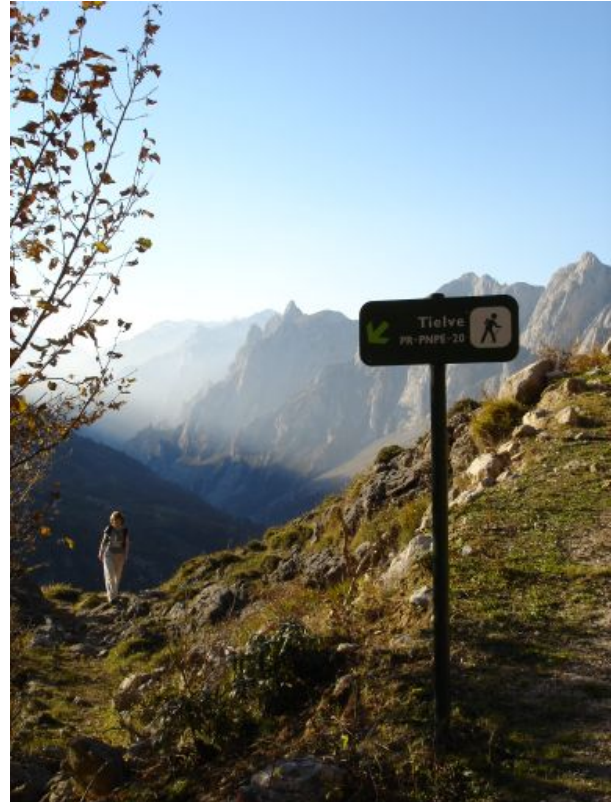
The Picos de Europa: some of Europe's most beautiful mountain scenery.

Space for your notes and questions for us