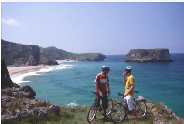
Mountain biking along the coast of the Picos.