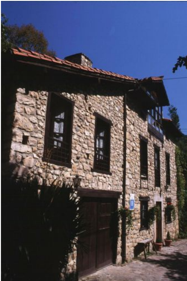
Your hotel: comfortable and very quiet, in a valley next to a stream.