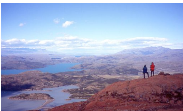
Looking out from Valle Frances in Torres del Paine