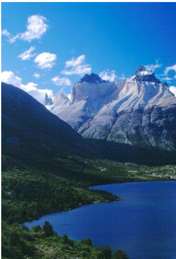
Looking across to the Cuernos of Torres del Paine National Park

Your hotel is close to the mountains at Cerro Catedral and Cerro Otto for walking.