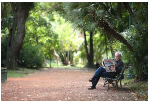
Get under the skin of Buenos Aires with your local guide.

Spend this morning in the company of your own private guide who can take you on and off the beaten track in this lively and beautiful city.