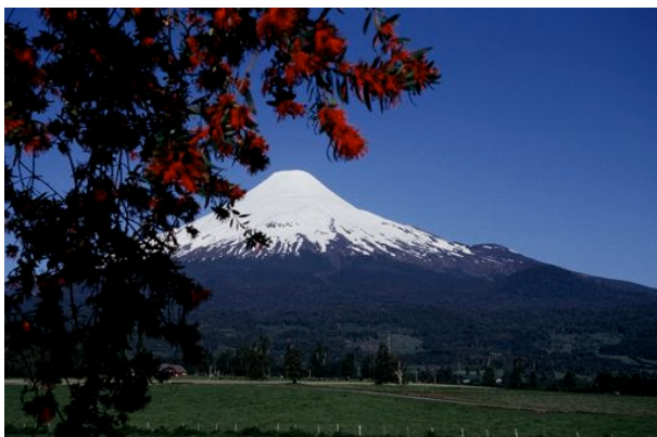
Views across the Chilean countryside towards Osorno Volcano