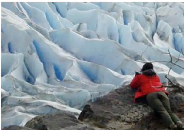
Watching the surface of Glacier Grey in Chilean Patagonia.