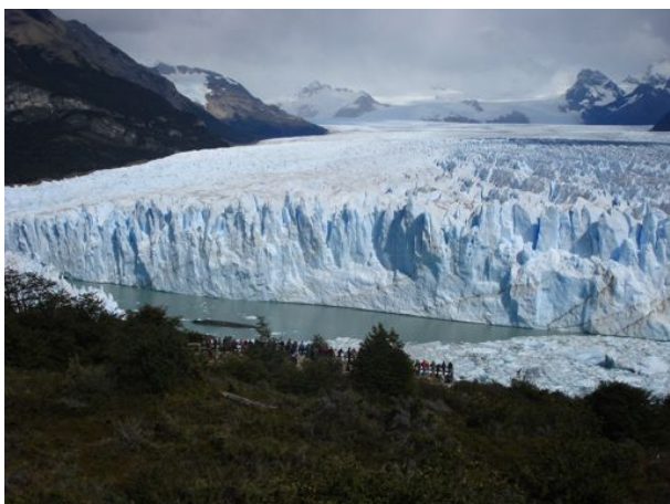
Admire the spectacular views at Perito Moreno

Spend the next four nights in the park exploring everything from the glaciers to the lakes, mountains, rivers and grasslands.