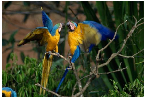
Blue and yellow macaws at the Tambopata clay lick.

Kayak the Tambopata River, mountain bike through the jungle, climb into the rainforest canopy.