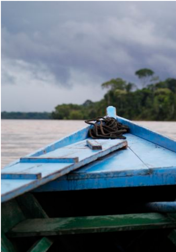
Travelling the Tambopata River to the lodge.