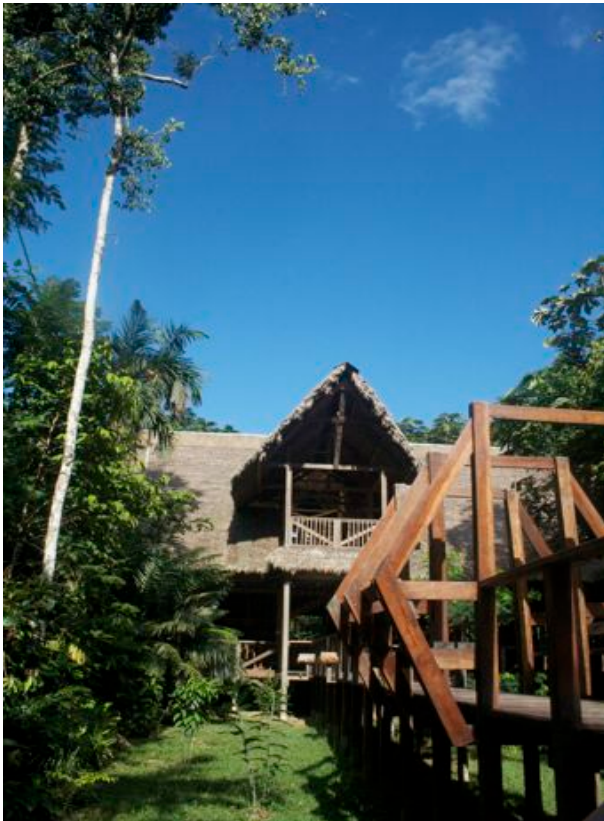
Refugio Amazonas lodge.