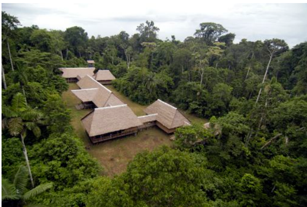
Looking down on the Tambopata Research Centre from the canopy.

You can book your trip to the Tambopata Research Centre with Pura Aventura by calling 01273 676 712.