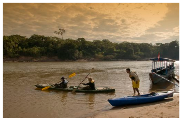
Enjoy a unique experience sea-kayaking in the Amazon.

Whilst here in the jungle you have a menu of excursions available to you throughout each day.