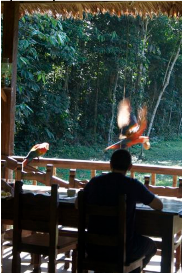
Breakfast at the TRC. Watch out, Macaws will steal your toast!

The forest on this trail, regenerating on old bamboo forest, is good for Howler Monkey and Dusky Titi Monkey.