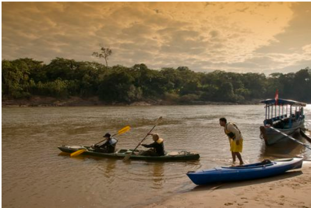
Canoeing down the Tambopata River.