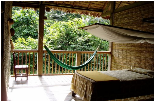
Comfortable but simple rooms in the Amazon, note the lack of one wall.

All excursions are led by one of a dedicated team of lodge guides, many of whom are from the local communities based around the Tambopata River.