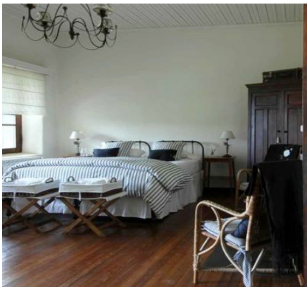
Stay in comfort at your estancia.