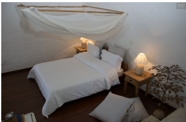
Simple but very comfortable rooms at Picinguaba.