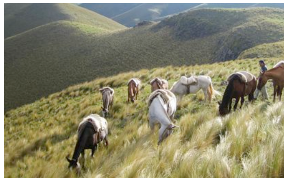
Enjoy riding the finest horses.

This is a Pura handpicked holiday with an activity rating of medium and comfort rating premium .