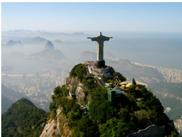
Looking out over Rio.