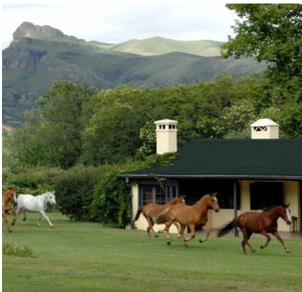
Ride through the beautiful surroundings of Cordoba.