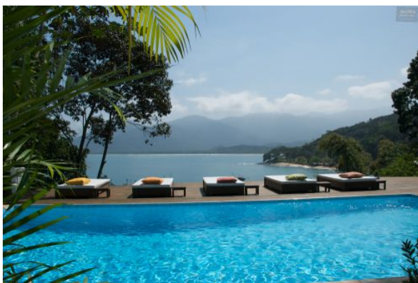
The pool area of your hotel at Picinguaba.