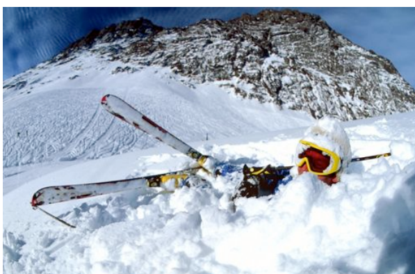
Deep fluffy powder