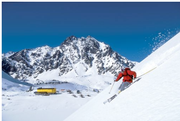
Skiing Roca Jack slope with the distinctive Grand Hotel Portillo behind.

This is a Pura handpicked holiday with an activity rating of medium and a comfort rating of premium .