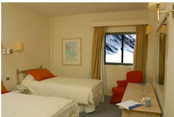
Small but comfortable rooms