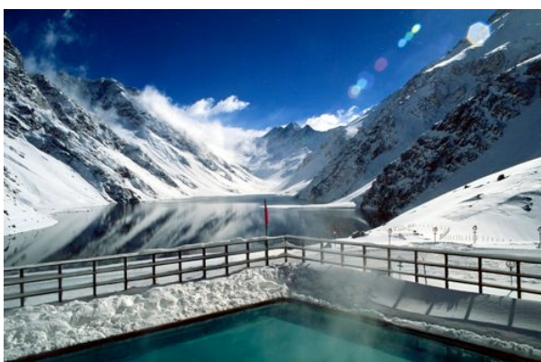
The pool and hot tub with a five star view.