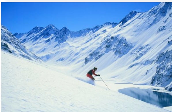
Near empty slopes in the highest stretch of the Andes