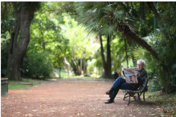
Time to explore Buenos Aires at your own pace.

Stroll to one of the restaurants nearby for supper.