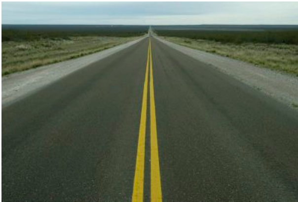
The beautiful solitude of the Patagonian Steppe.