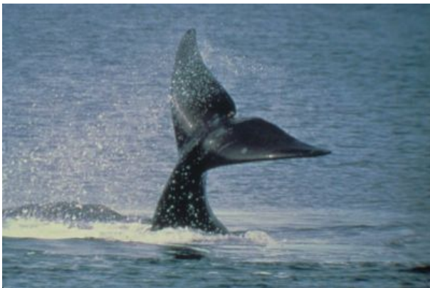
A breaching Southern Right Whale.