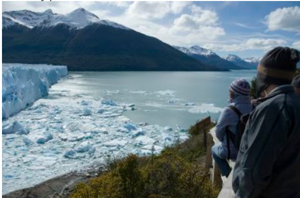
Admire the spectacular views at Perito Moreno

The route you drive takes you along lakes Argentino and Viedma with wonderful views of Fitzroy. Settle in to your comfortable lodge, staying in a superior mountain view room. (b)