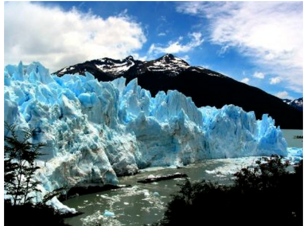
The spectacular Perito Moreno Glacier.

This is a Pura handpicked holiday with an activity rating of low and a comfort rating premium .