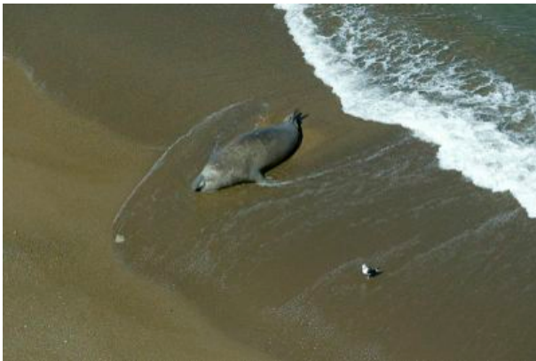
An Elephant Seal has a rest on the Peninsula Valdes.