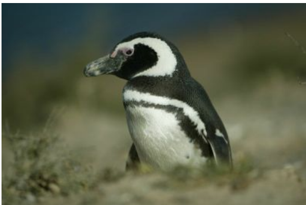
Visit the penguin colony at Punta Tombo.

Alternatively, drive out to the Welsh settlement of Gaiman for tea and cake.