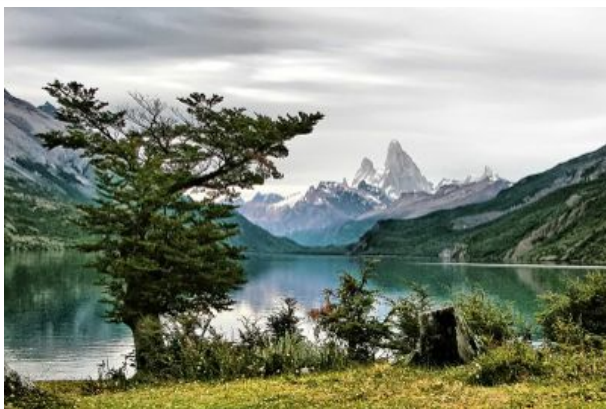
Views of Cerro Fitzroy from the shores of Lago Argentino.