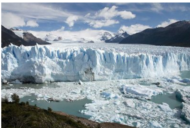
Time to enjoy the incredible Perito Moreno Glacier.