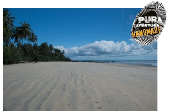
Wander along the empty beaches of Boipeba.

This is a Pura handmade holiday with an activity rating medium and a comfort rating first .