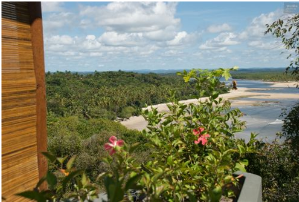
Rooms with a view.