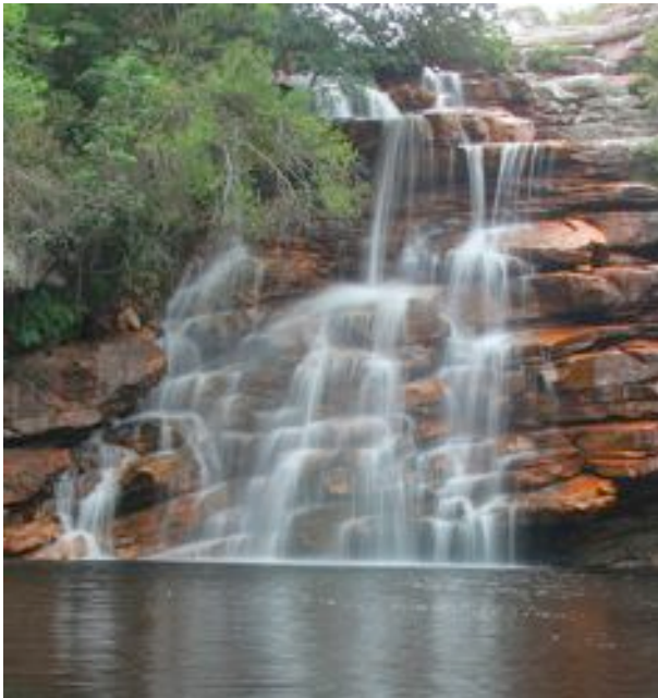
The waterfalls at Poco do Diabolo near Lençóis.