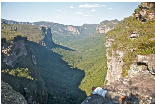
Looking down from the dry lip of a waterfall at Cachoeirão

Even when the waterfalls and pools above ground are at their driest, just under the surface of the landscape are many beautiful underground lakes.