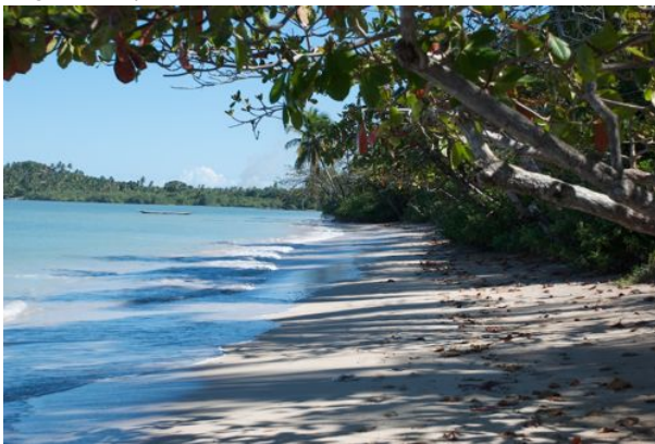
The sands of Boipeba