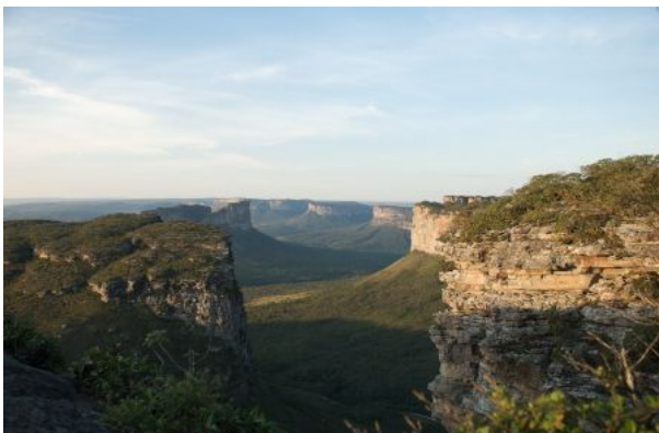
Sunset from the hill of Pai Inacio.

On arrival you are collected by your guide who takes you to your charming hotel in a colonial area just away from the main centre of Pelourinho.