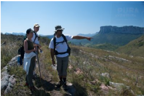
Walking across the Chapada Diamantina