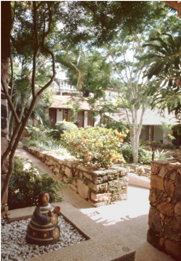
Stay in a selection of carefully chosen small hotels.