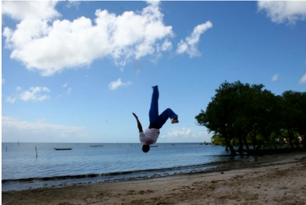
Locals on Boipeba practicing their capoeira.