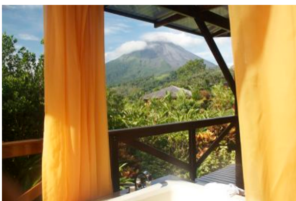
The smoking cone of Arenal volcano as seen from your hot tub.