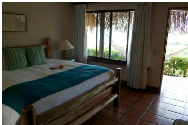
Delightfully comfortable and airy rooms, this the standard level.

The cloudforest canopy is extremely rich with humming birds, colourful butterflies, exotic frogs and orchids.