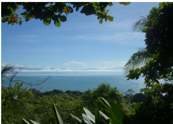
A view across the trees to the Golfo Dulce