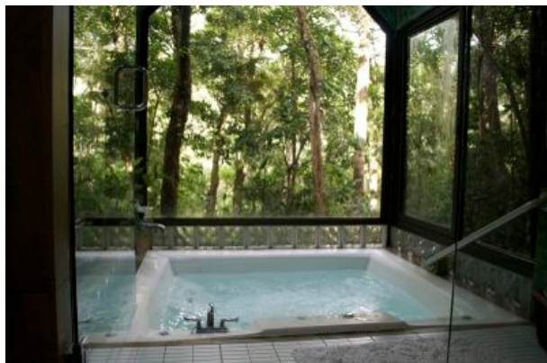
The cloudforest of Monteverde from your treehouse.