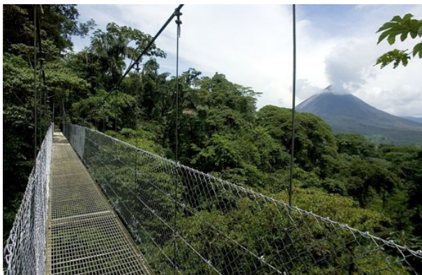
A view across the treetops from a walkway at the Hanging Bridges

According to National Geographic, this region of Costa Rica is "the most biologically intense place on earth". (b,l,d)