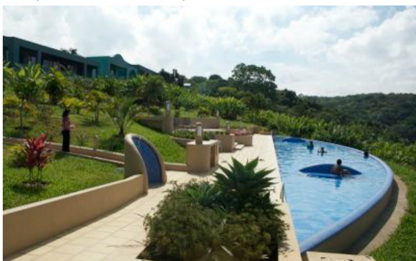
San Jose, your luxurious spa hotel overlooking the Central Valley.

The hotel is set amid 40 acres of coffee and fruit plantations and has a number of self-guided trails.