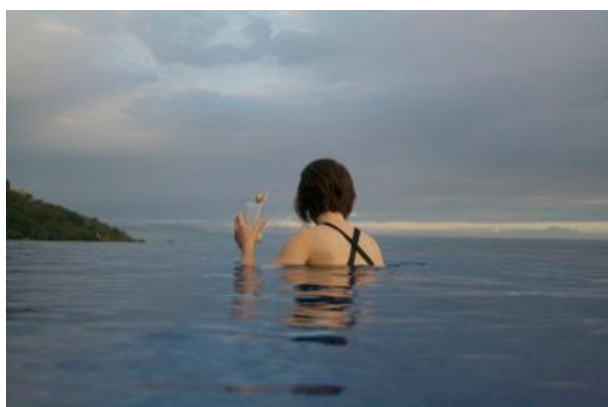
Cocktail hour at Punta Islita