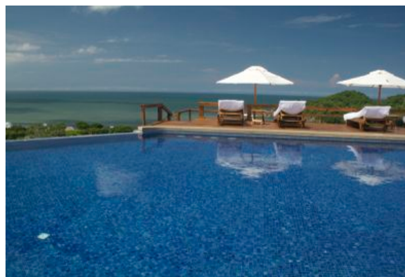
The lovely pool at Punta Islita

This is a Pura handpicked holiday with an activity rating of low and a comfort rating premium .