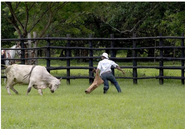
A feisty bull gives a local cowboy a run for his money

When you are ready drive north along the coastal to Manuel Antonio. This should only take an hour.