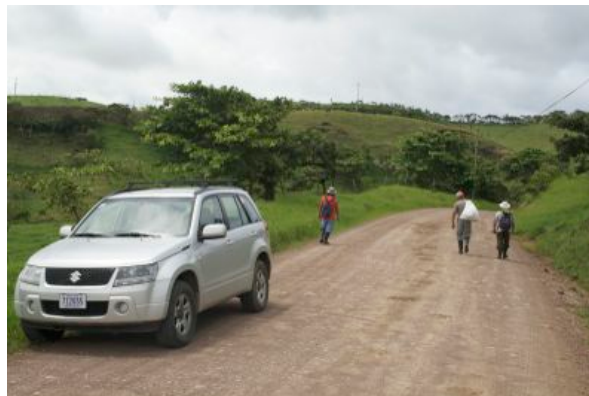
Explore the traditional landscapes of Costa Rica at your own pace

This is a Pura handpicked holiday with an activity rating of low and a comfort rating first .