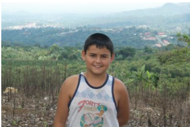
Enjoy a warm welcome as you travel off the beaten track

Please note international flights are quoted separately.