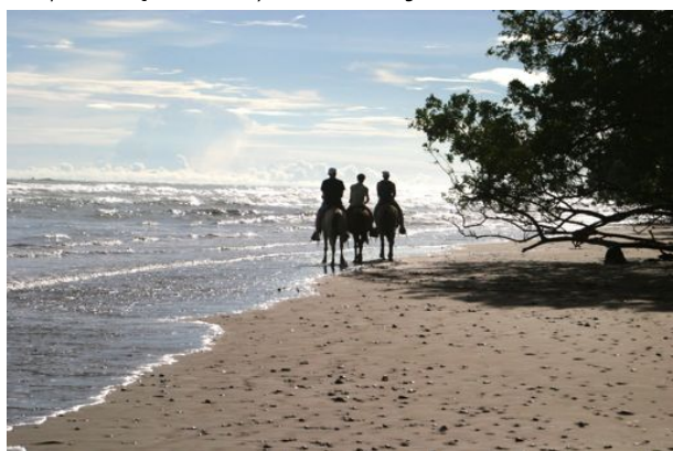
Horse riding in the afternoon light at Dominical