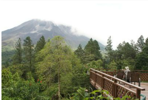
The view from your hotel at Arenal