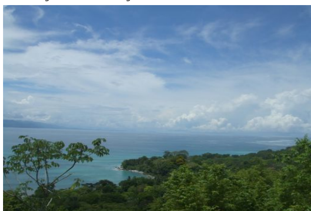
Looking out onto the Pacific from the hillsides at Dominical

Spend the next two nights in a lodge at San Gerardo de Dota, in the heart of the cloudforest. (b)