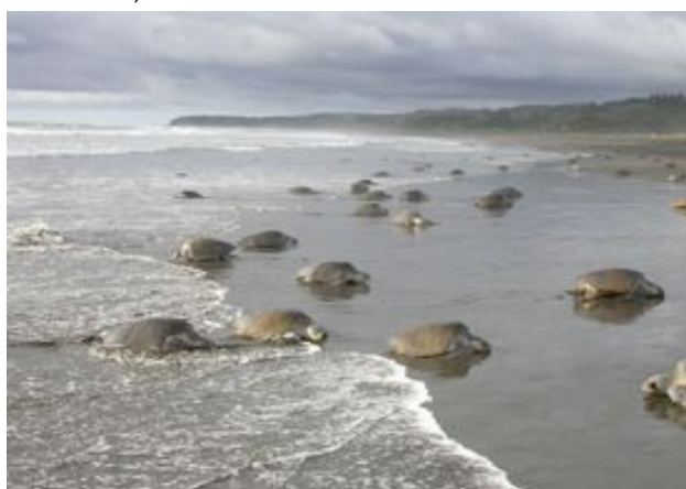
Turtles on the beach near Ostional