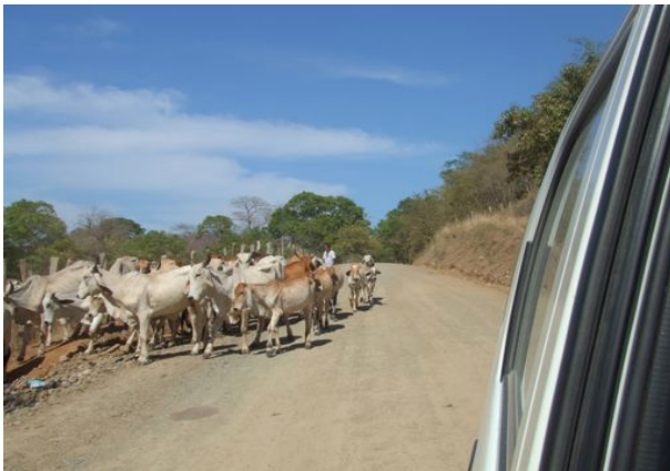
The most common traffic you'll encounter in Rincon de la Vieja