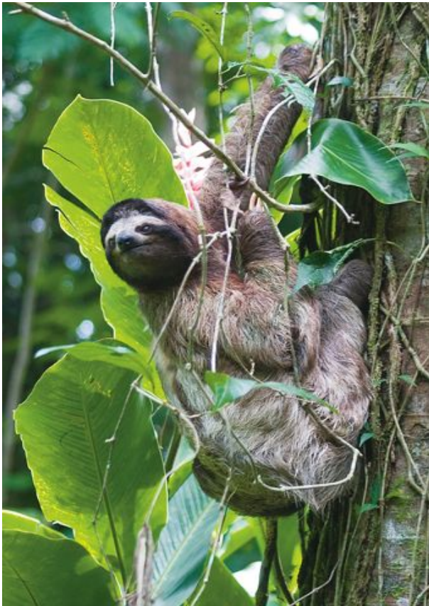
A well camouflaged sloth debates his next move