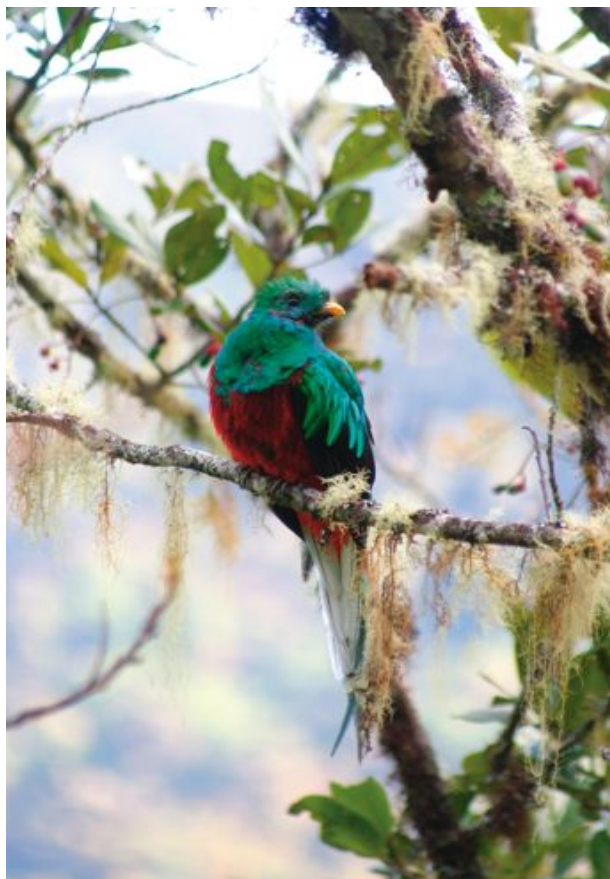
A Resplendent Quetzal surveys its surroundings in San Gerardo