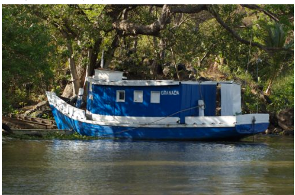
A boat moored in Las Isletas de Granada