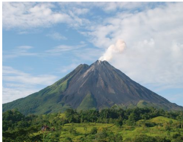
Steam rising from the crater of Arenal volcano.

This is a Pura handpicked holiday with an activity rating of low and a comfort rating first .