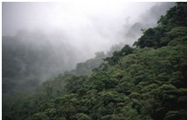
Mist rising from the Bosque de Paz cloudforest