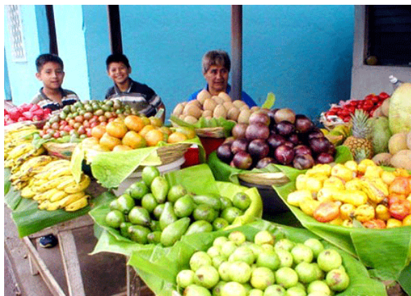
Market day in Granada.

Nevertheless it is very attractive and enjoyable.