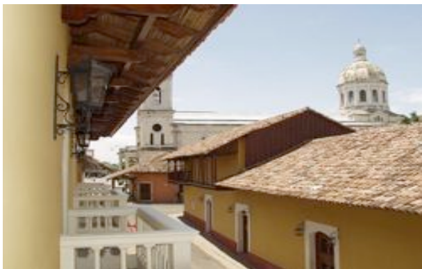
Looking out onto the pretty cobble streets in Granada