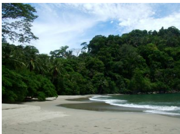
The beach at Manuel Antonio

This is a quiet haven, with tumbling mountain streams and secluded forest paths.