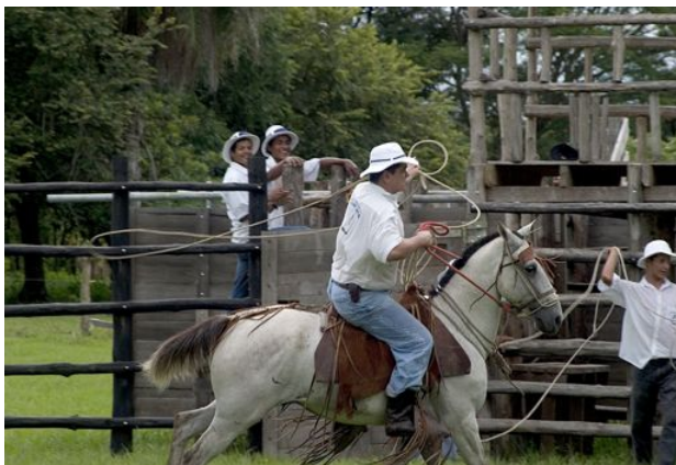
A cowboy shows off his skills at Rincon de la Vieja