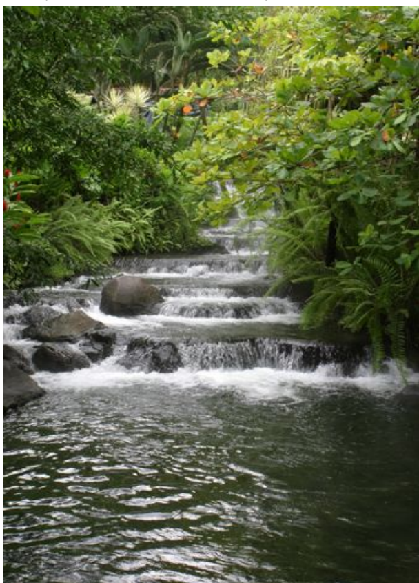
The hot springs at Arenal