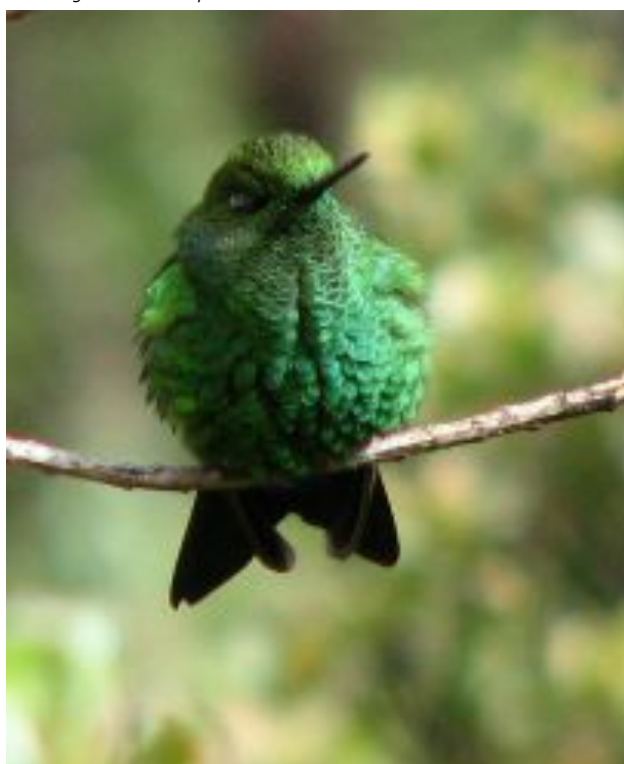
Look out for humming birds at Bosque de Paz, which are common.