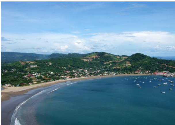
The bay at San Juan del Sur.

Mombacho is home to three species of monkeys, 168 of birds, 30 of reptiles and 60 mammals.