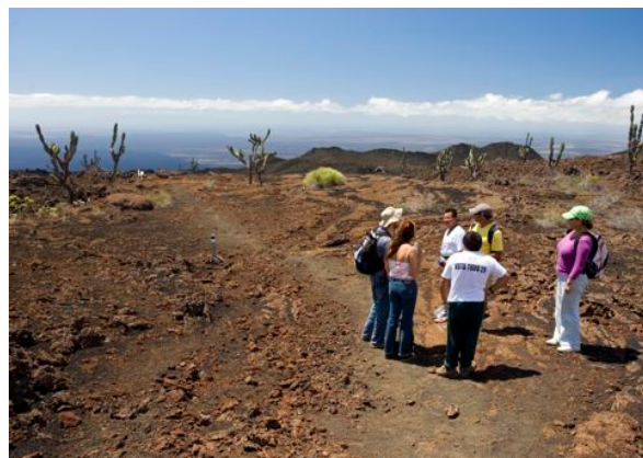
Enjoy great wildlife, landscapes and private guiding to go at your pace.

This is a Pura handpicked holiday with an activity rating of medium and a comfort rating first .