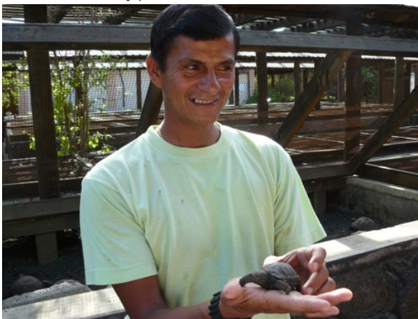
Visit the giant tortoise breeding program.

Spend this afternoon with the local community. Your visit is not intended to be a pre-planned activity as such, but rather a relaxing, informal social visit.