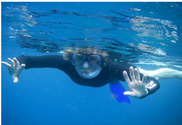
Snorkel and swim the clear, cool waters on most days.