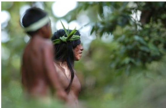
Stay with the Huaorani people of Ecuador's Amazon.

Quito is surrounded by high Andean peaks so the landscapes are beautiful.