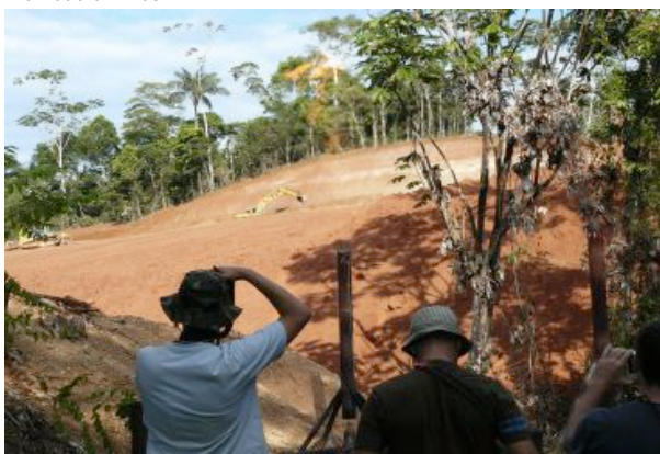
Guides explain the issues around conservation and protection.