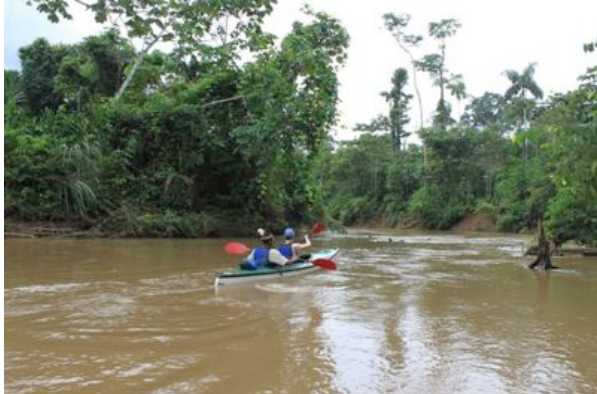
Paddle out of the Amazon at the end of your stay with the Huaorani.

The trail winds through the trees and over quiet streams, opening out at a small oxbow lake. Standing on a small raised hill it is possible to see colonies of leaf cutter ants at work, along with various aquatic birds at the edge of the water.