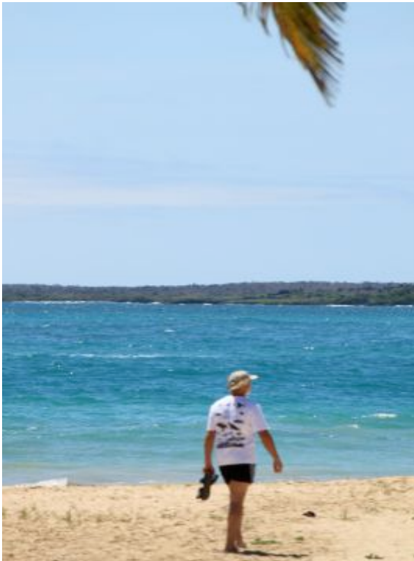
Enjoy the sandy beaches of the Galapagos Island.