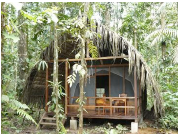
The simple but comfortable Huaorani Ecolodge.