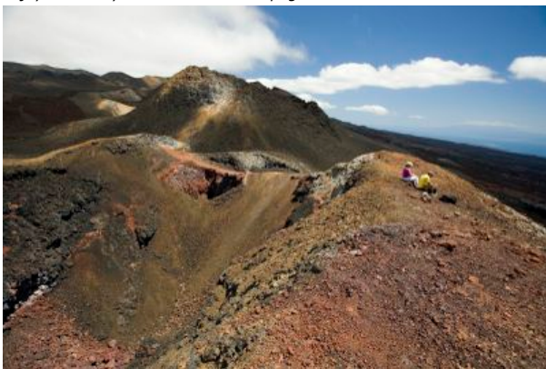
Hike volcanoes and enjoy the views.