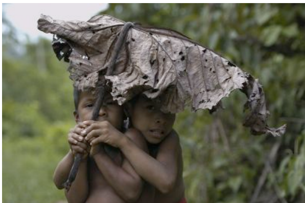
Two Huaorani kids.