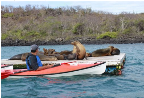
Kayak to a sea lion colony.