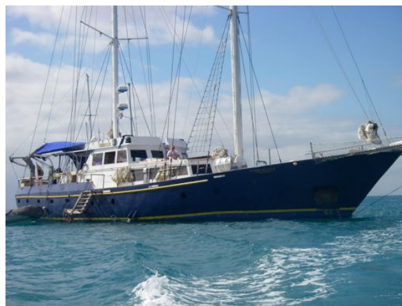
The first class yacht Beagle

This is a Pura handpicked holiday with an activity level of low and a comfort rating of first .