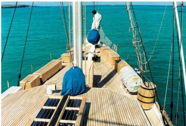
The spacious forward deck of Beagle.