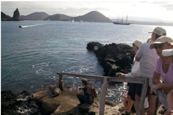
Waiting for a lift to snorkel at Pinnacle Rock

This small island is packed with blue-footed boobies and frigate birds.