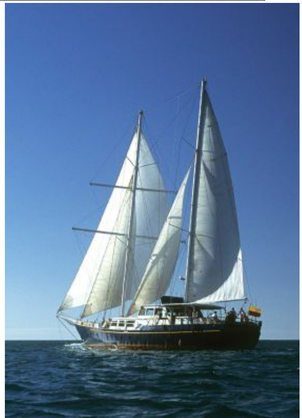
The sails go up only occasionally but it is a pretty sight.

Questions? Ready to book? Call us on 01273 676 712