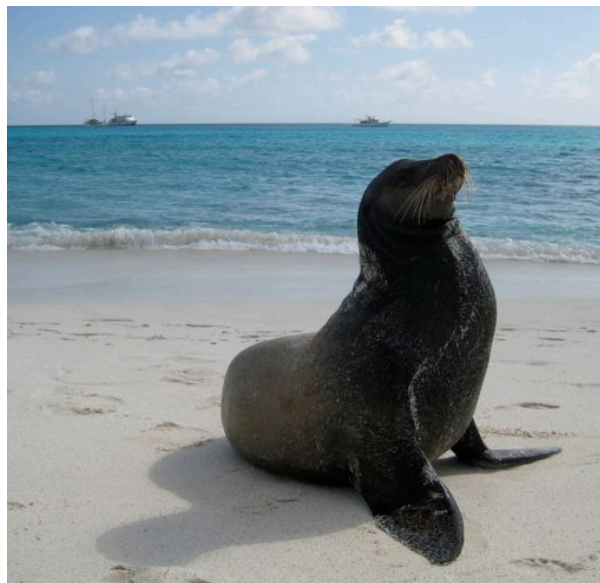
A proud sea lion on Espanola Island

Snorkel in the nearby bay where you might get to swim with sea lions. This afternoon land on 'sea lion beach'.