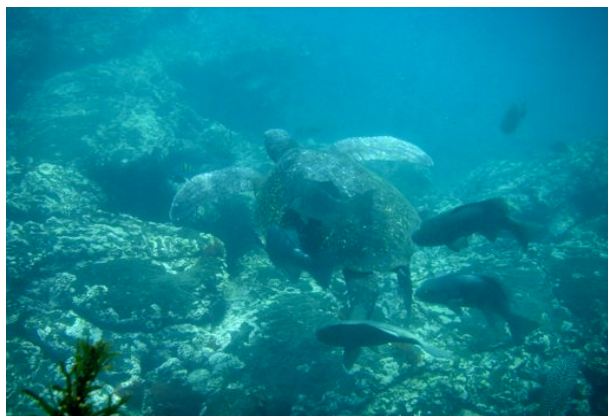
Isabela Island: a friendly sea turtle.

Pass flightless cormorants on your way back to the boat.