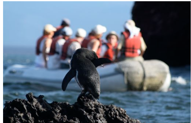
A tiny Galapagos penguin on the Mariela Islands

There is very still little sign of life on these fairly new flows although a couple of isolated lagoons are now home to some vegetation and birdlife.