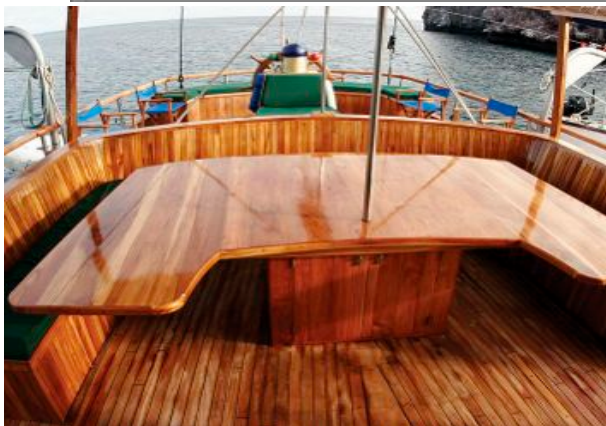
Dining outside on the rear deck is a popular option.