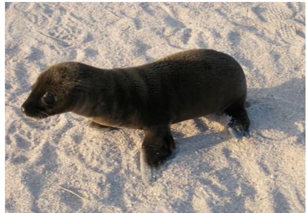
A pup on Espanola.

Transfer to the airport at Baltra for your flight back to the mainland. (b)