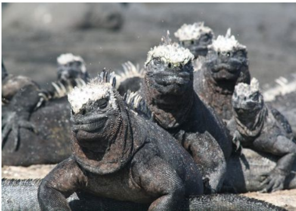
Fernandina Island: a marine iguana pile-up.

Walk to the jagged lava of Punta Espinosa to see marine iguanas warming themselves on the lava.