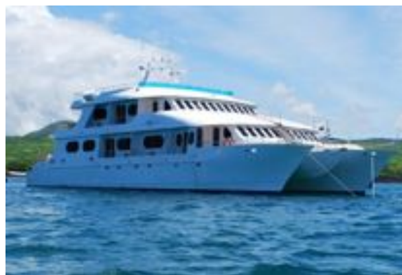
The deluxe class catamaran, Nina.

This is a Pura handpicked holiday with an activity level of low and a comfort rating of premium .