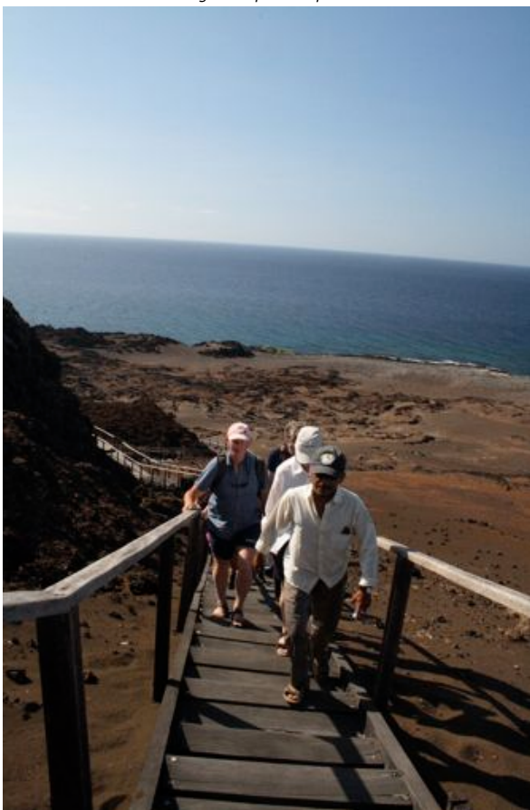
Walking up Bartolomé island

Continue to Kicker Rock, a magnificent rock formation rising 120m from the sea with a split with towering vertical walls on either side. The cliffs are home to frigate birds, blue-footed and masked boobies. (b,l,d)