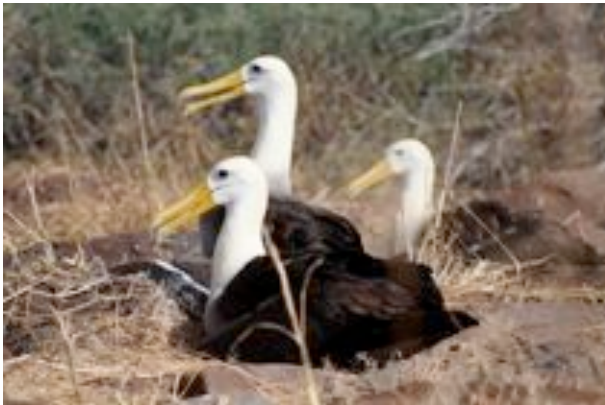
Nesting waved albatross on Espanola