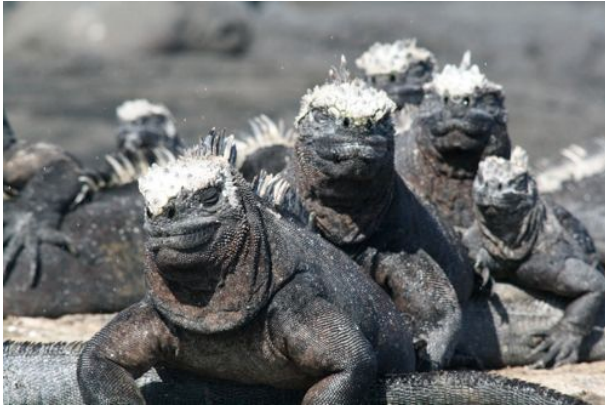
Fernandina Island: a marine iguana sunbathing.