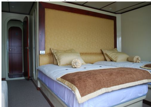
Comfortable and relatively spacious cabins on board Nina.