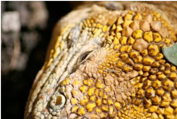
A land iguana in close up.