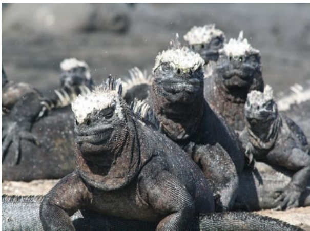
Fernandina Island: a marine iguana pile-up.