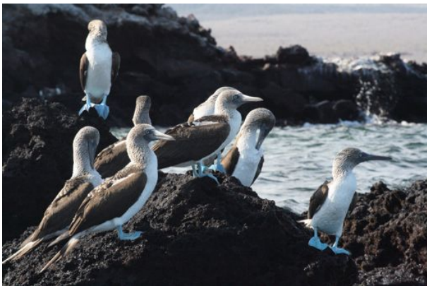
Isabela Island: blue footed boobies on the rocks.