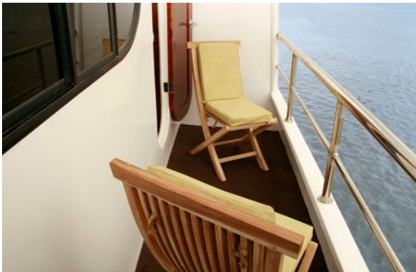
Private balconies for all cabins

Walk across surreal lava landscapes to a huge iguana colony.