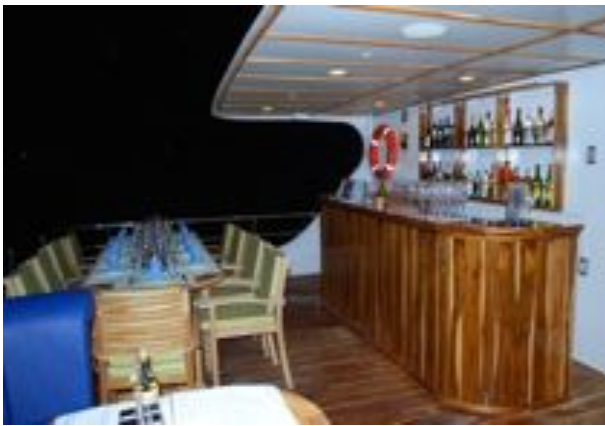
Outdoor bar and dining area.