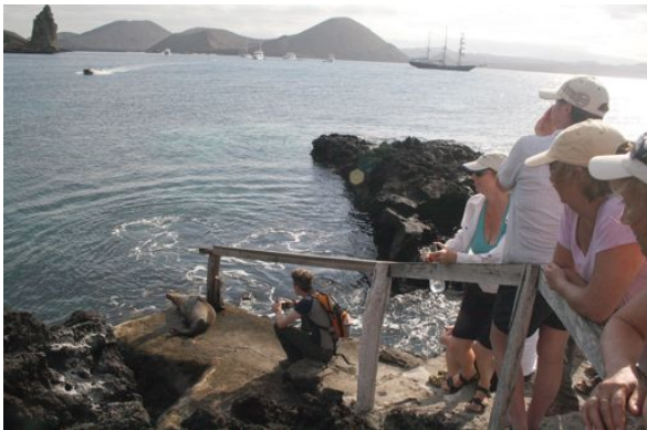
Humans and sea lion waiting to be picked up at Bartolomé.