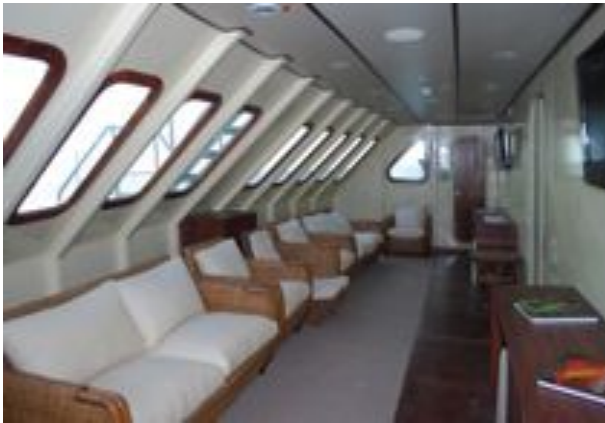
Comfortable modern interiors.