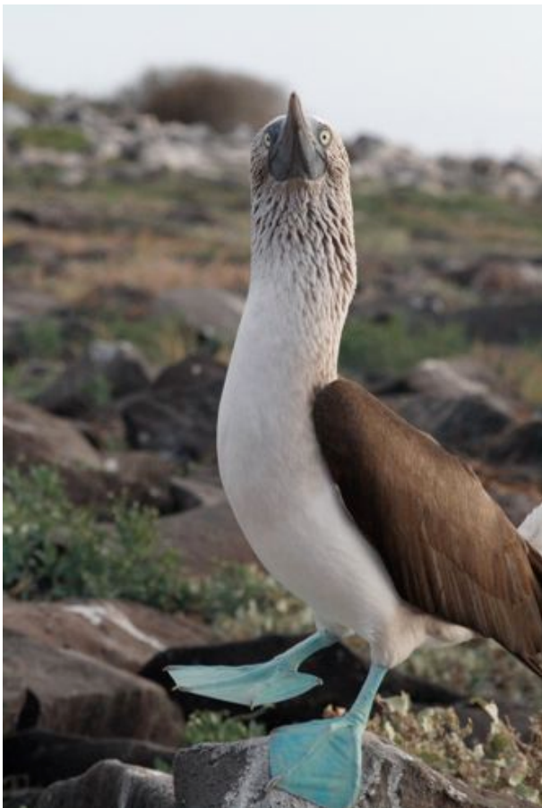
The mating dance of the Blue Footed Boobie.

Along the coast sea lions and marine iguanas surf on the waves. Here you have another chance to get in the water to snorkel, this time in fairly deep water. (b,l,d)