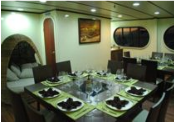
Indoor dining area.