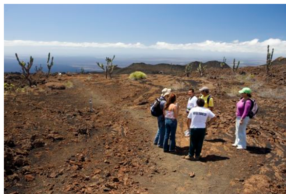
Enjoy great wildlife, landscapes and private guiding to go at your pace.

This is a Pura handpicked holiday with an activity rating medium and a comfort rating first .