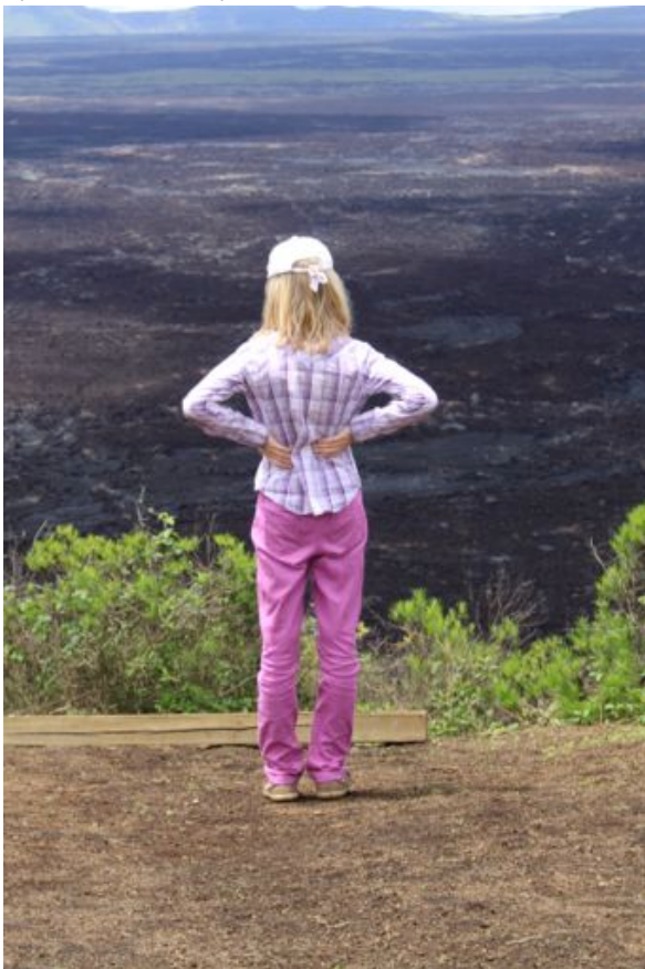
Looking out over Sierra Negra, the second largest crater in the world.

This will be your first chance to get in the water and swim or snorkel with the playful and fearless inhabitants of the islands. (l,d)