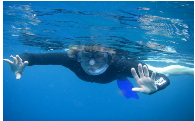
Snorkel and swim the clear, cool waters on most days.

For these Santa Cruz is the ideal start point. (b)