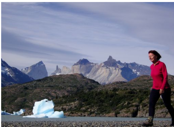
Walking on 'iceberg beach'

To get into Bariloche you can take a taxi which the hotel can arrange for you – taxis are reasonably priced.