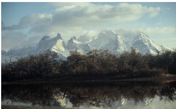
Visit the Torres del Paine massif