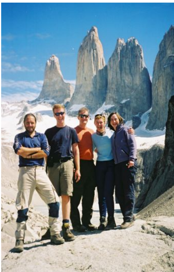
Standing in front of the Torres