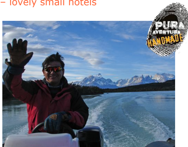
The Serrano River with the Paine massif in the background.

This is a Pura handmade holiday with an activity rating of medium and a comfort rating first .