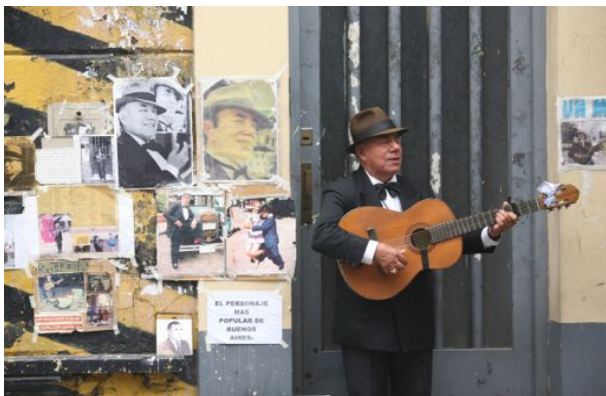
Get under the skin of Buenos Aires with your local guide.

Spend this morning in the company of your own private guide who can take you on and off the beaten track in this lively and beautiful city.