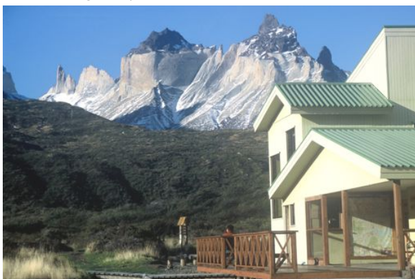
The most modern of the refugios in Torres del Paine.