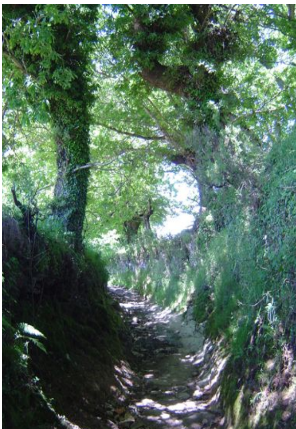
A lovely stretch of the Camino near Sarrios

This afternoon make your way into the city centre to take in the atmosphere in the Plaza del Obradoiro where pilgrims finish their long journey. (b)