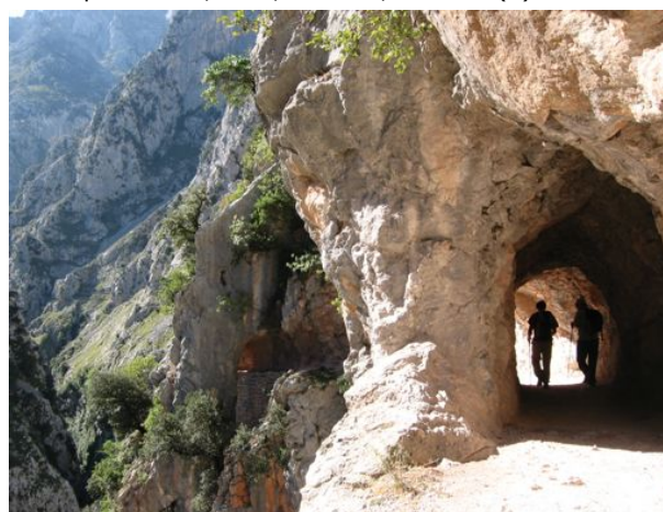
Towards the far end of the Cares Gorge.

Walk up to 22km, 6hrs, \blacktriangle 250m, \blacktriangledown 250m (b)