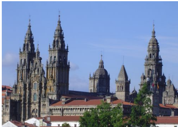
The cathedral at Santiago

This afternoon make your way into the city centre to take in the atmosphere in the Plaza del Obradoiro where pilgrims finish their long journey. (b)