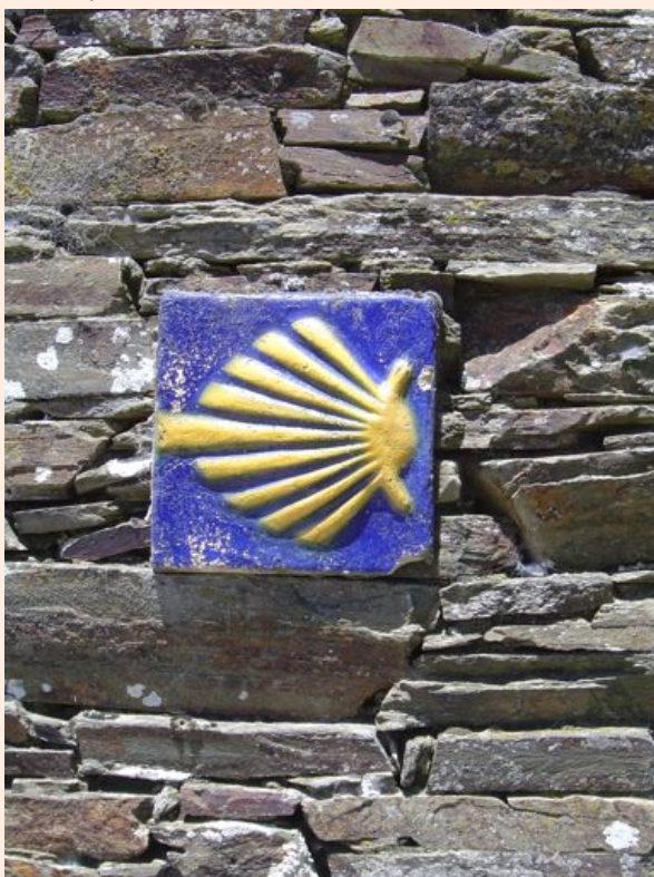
Coquille St Jacques (St James/Santiago), symbol of Christian pilgrims.

The Camino del Norte follows a rugged coastline dominated by high mountains and is therefore infinitely more scenic.