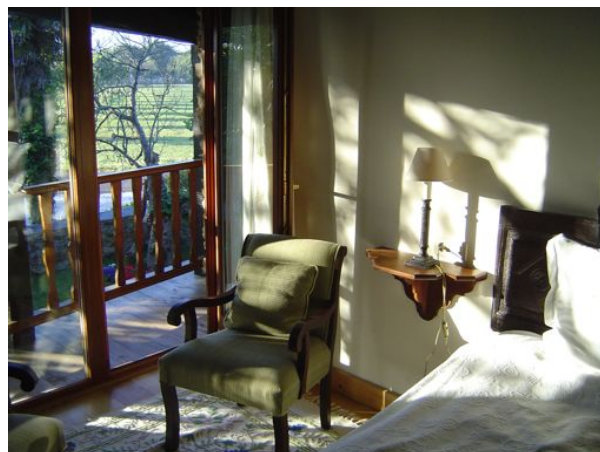
Your small hotel near Ribadeo

To book or for more information call us on 01273 676 712