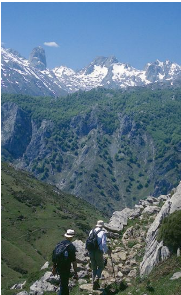
Taking the high Roman road across the Picos.

In Roman times, the Picos were inhabited by much feared tribes. As hard as they tried, the Romans could not cope with the guerilla tactics used in the mountains.