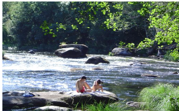
Take time to read and relax.

This afternoon walk along a tree-shaded river within the reserve. (b)