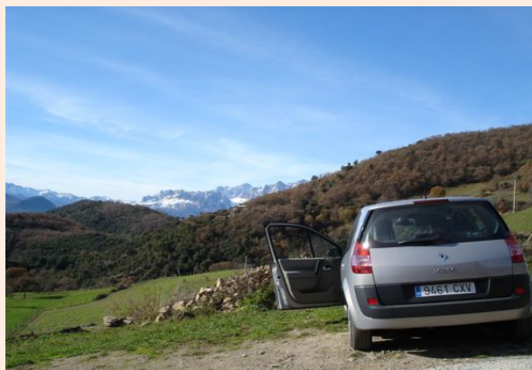
Freedom and flexibility without the guesswork.

Your Pura guide also helps you map out the best possible holiday according to weather forecasts, local festivals, your energy levels, etc. They can also help you make any calls you need to book optional activities. Think of it as a bit of fine-tuning.