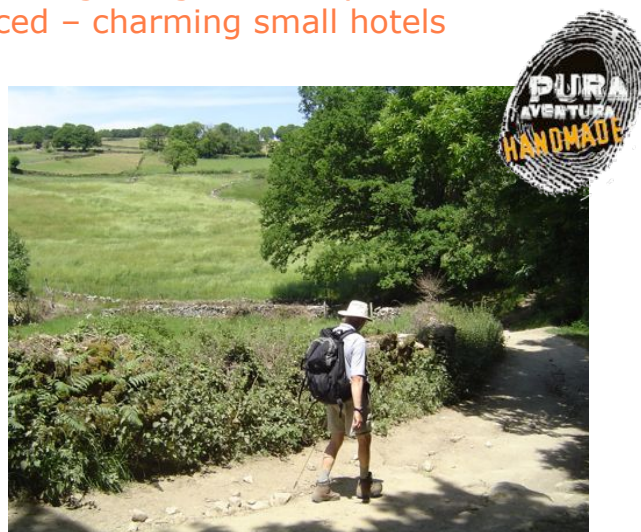
Walking part of the Camino de Santiago

This is a Pura handmade holiday with an activity rating of medium and a comfort rating first .