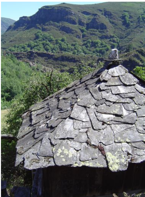
The distinctive rural architecture of Oscos.