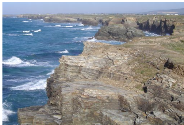
The rugged coast near Ribadeo

Use your local information to find the quietest beaches, prettiest villages and best restaurants. (b)