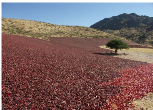
The peppers drying in the sun on the way to Cayafate.