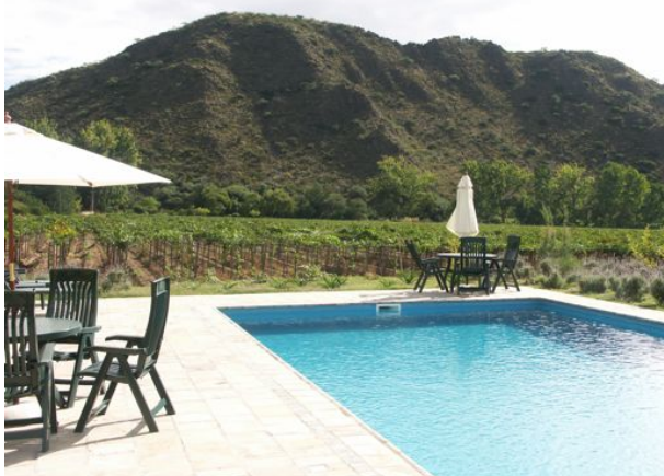
Stay in the heart of a vineyard at Cayafate.

Travel along roads that snake through the brilliant red rocks of the Valley of the Shells or wind through cloudforest, all with the backdrop of the Andes.