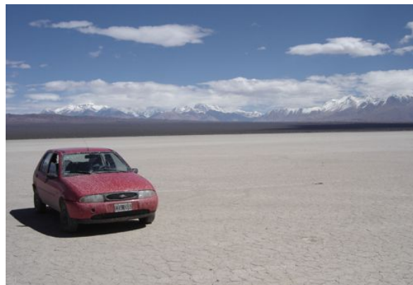
The salt flats above Salta with the Andes in the background.

This is a Pura handpicked holiday with an activity rating of low and a comfort rating premium .