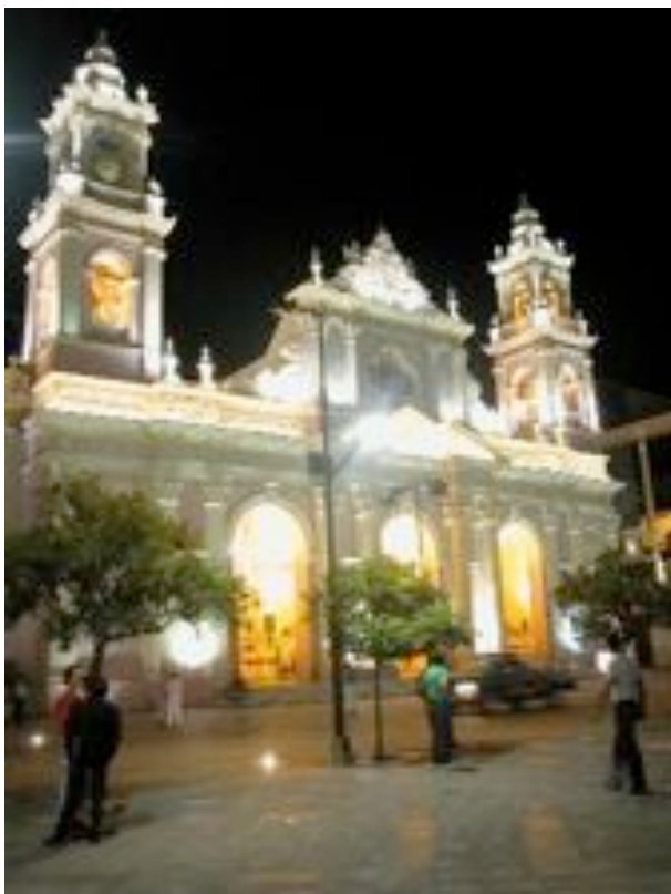
The façade of the cathedral in Salta