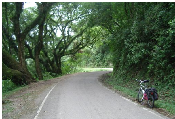
The cloudforest of La Cornisa.