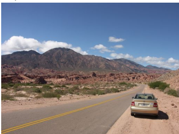
Enjoy the freedom to explore at your own pace.