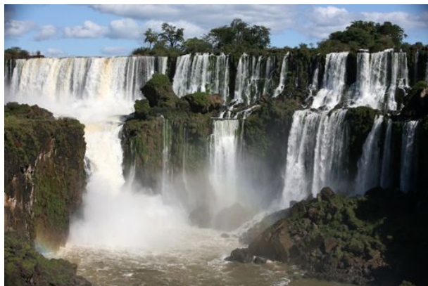
The Iguassu Falls

Start by driving up the Route 68 through the Valley of the Shells before you reach Salta.